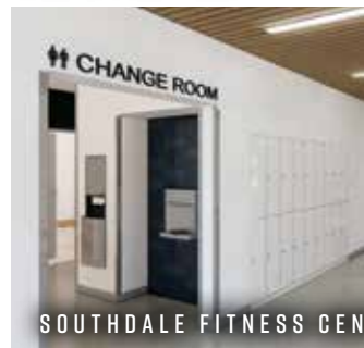
SOUTHDALE FITNESS CEN