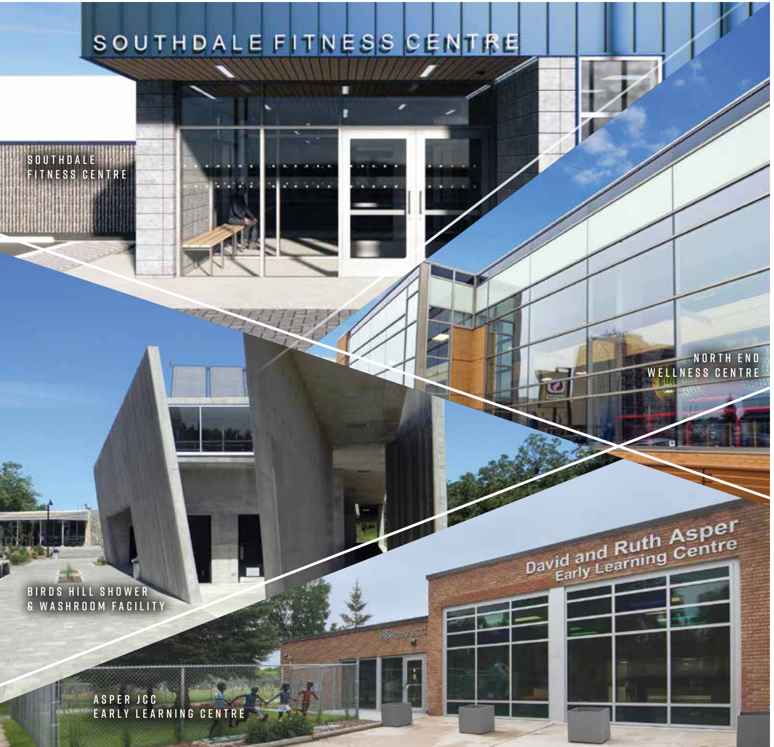
SOUTHDALE FITNESS CENTRE